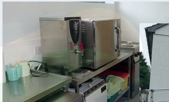
New kitchen equipment

It provides a meeting space and drop in centre for locals and visitors alike. The hall also plays an important role in the Bridge of Orchy Community Resilience Plan providing a place of shelter in the event of an emergency.