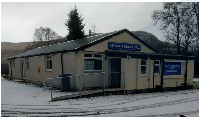
Before repair and extension works were carried out

The village hall is a key asset in the remote Argyll community of Kilmore and Kilbride, serving many community groups, public meetings and local events. Like many rural village halls, maintenance and repairs are an ongoing financial challenge.