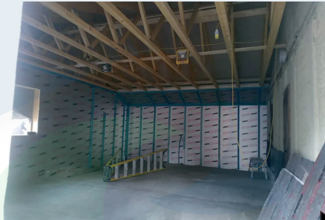
Extension work in progress